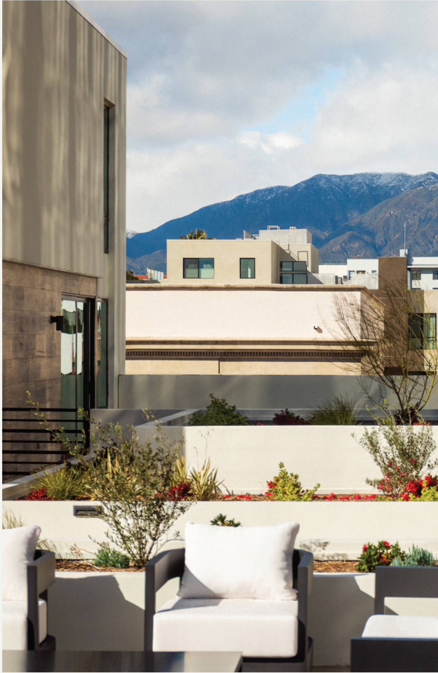
SAN GABRIEL MOUNTAINS | LEVEL 5 AMENITY DECK