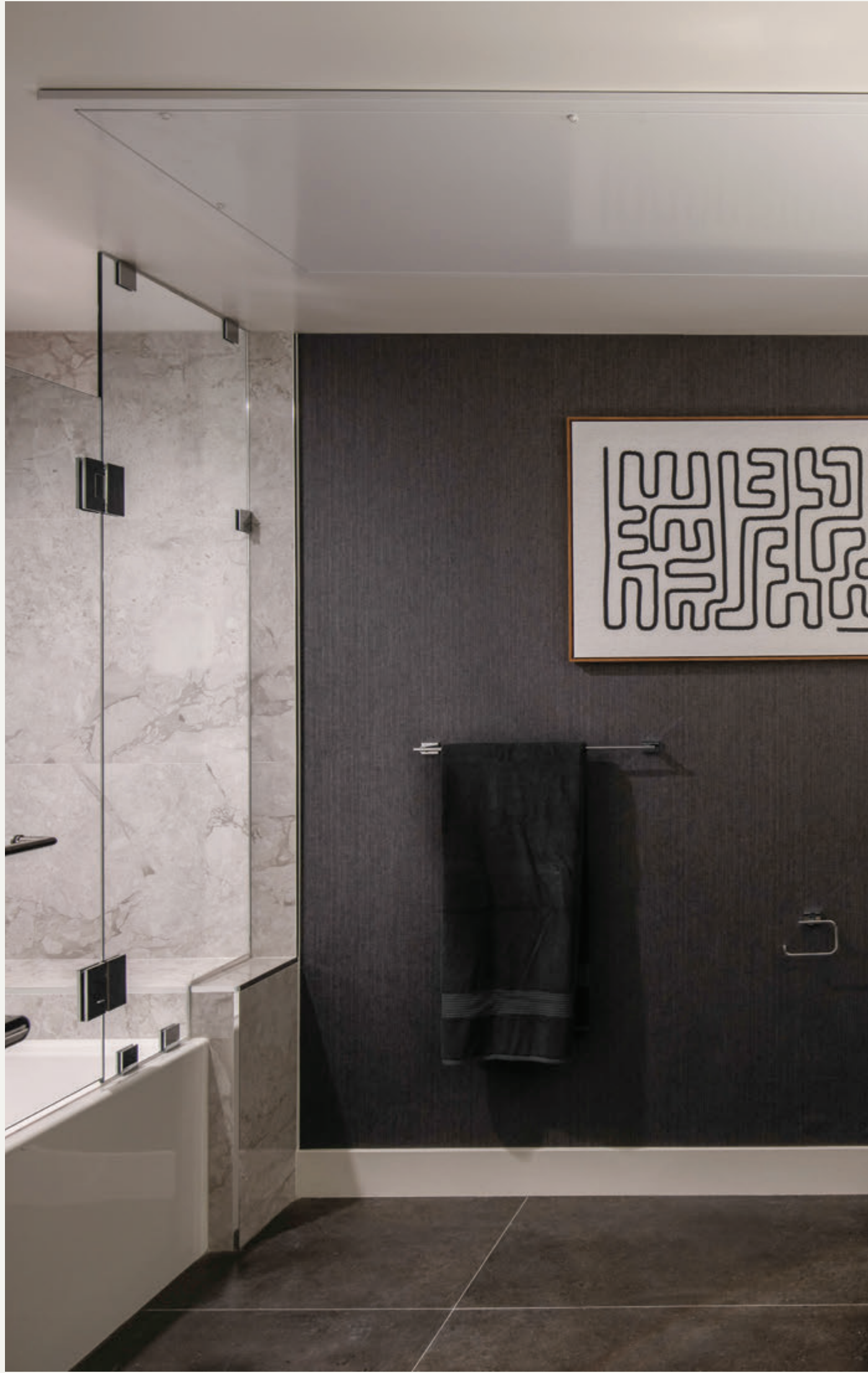
THE COLLECTION AT 380 CORDOVA